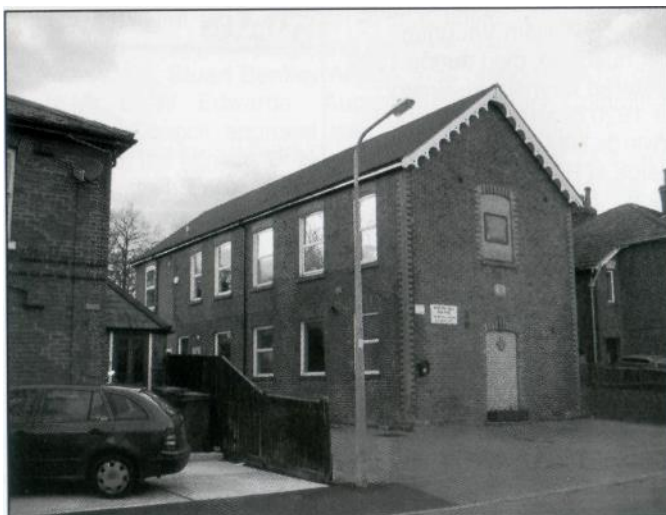
THE MARTIN HALL AT 19 BROOK ROAD

Moving on fifty years to a 1947 map, that same Victorian residence is now stated to be 171 Bitterne Road, and an elongated building termed "Library" stands next to it at the junction of Bitterne Road with Cobbett Road. Perhaps you can remember the children's Wendy House that stood for decades on the verdant lawn in a spacious garden and under the shade