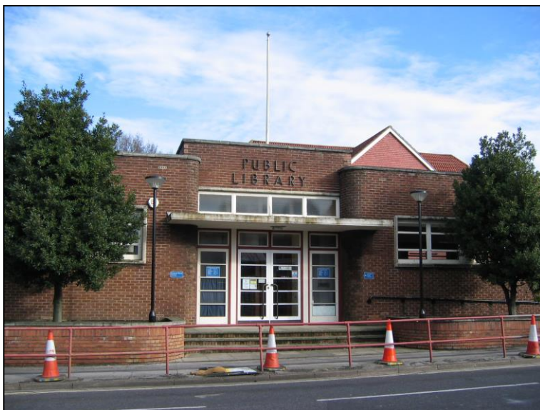
2007: LIBRARY BEFORE WINDOW REPLACEMENT

Cobbett Road Library today soldiers on with a small staff and thriving continual community involvement supported by the ‘Friends of Cobbett Road Library.’ The reading room has become the community room after decoration and renovation, whilst the original wooden window frames have very recently been replaced with pristine, white plastic, double-glazed windows and the exterior smartened up. The building faces the future, face-lift complete, having served the people of the area brilliantly for 71 years with lots of life left in the old girl yet as she marches strongly towards her centenary.