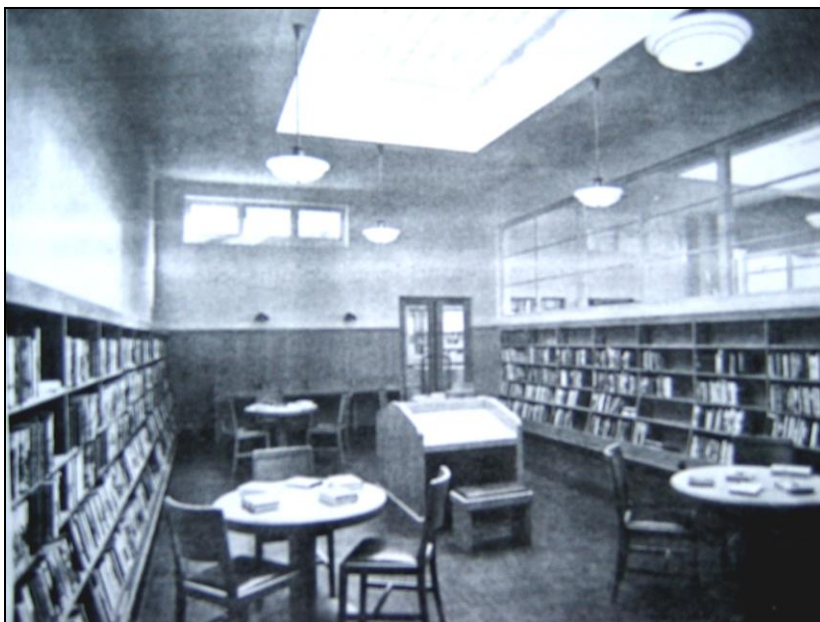
CHILDREN'S LIBRARY FEATURED IN 1939 OPENING DAY CATALOGUE

An epidiascope (an optical lantern) was available in the Children's Library to project images. This was absolutely cutting edge technology at that time! In the main adult lending library wall cases were designed to have bottom shelves specifically tilted for better display of the 7,000 volumes available. Certainly every thought went into making the design of both the library and its furniture as effective as possible for purpose. Everything, even the display cabinets and homework study desks, were designed by the architectural team and appear in detail on the plans.