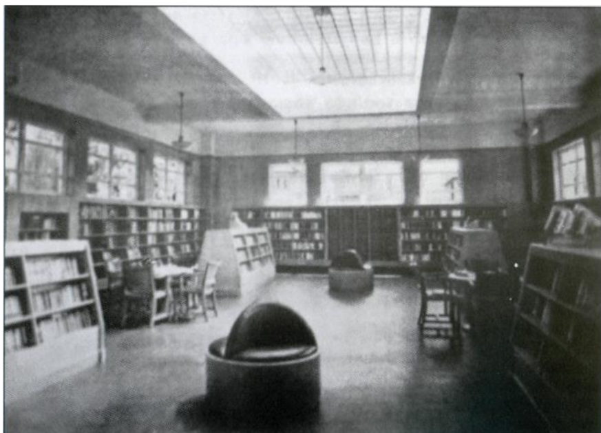
ADULT LENDING LIBRARY (FROM THE OFFICIAL OPENING CATALOGUE)